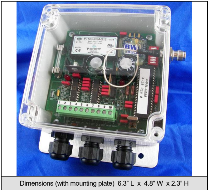
Dimensions (with mounting plate) 6.3" L x 4.8" W x 2.3" H